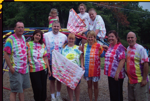
Tie Dye - Modeling Our Wears!