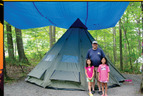
Our Wooded Tent Sites.