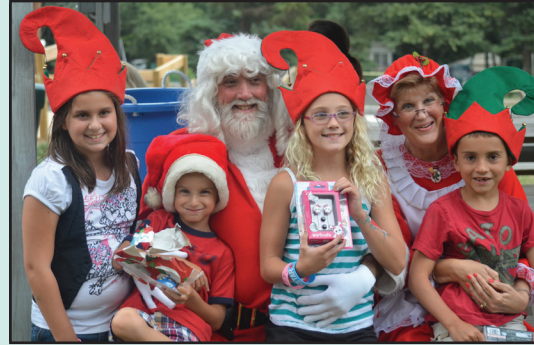
Christmas in July.

Outdoor Activities - Playground, Beach Volleyball, Quoits, Horseshoes, Boccie Ball, Croquet, Badminton, Ladder Golf, Bean Bag Toss.