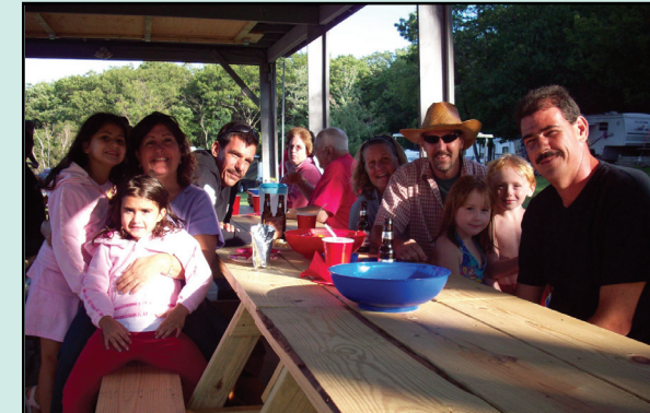
Friends and family gather for a Seasonal Guest Party.

For further details and a complete schedule, please check out our website.