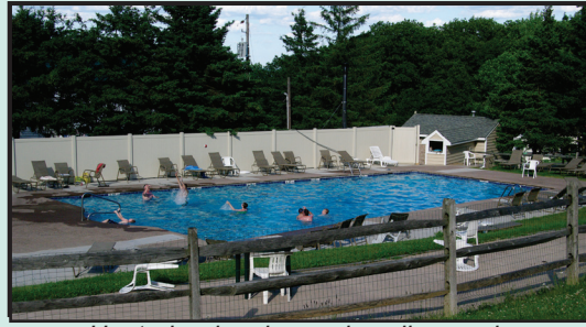
Heated swimming and wading pools.

Mount Pocono Caampground & Camp CaN-DOO offer free mid-week stays for cancer patients, their families & caregivers!