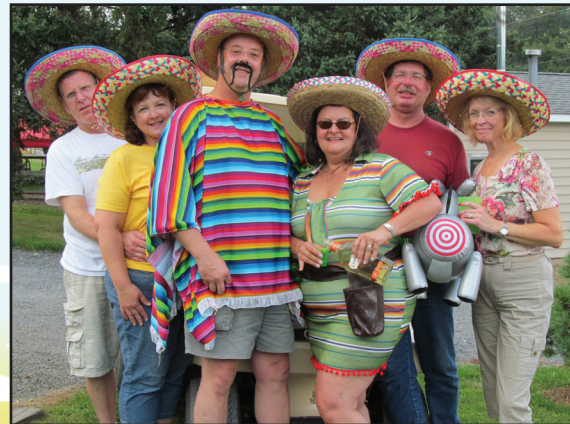
August Race Weekend.